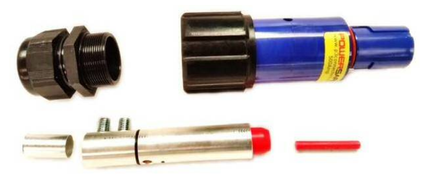
Component Parts of Typical Line Connector (Drain Version Shown)

The recommended assembly procedure has been devised to show step-by-step how to terminate cables to our set screw contact. For a satisfactory termination it is essential that the recommended assembly procedure is used.