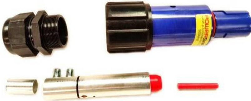
Component Parts of Typical Line Connector (Drain Version Shown)

The recommended assembly procedure has been devised to show step-by-step how to terminate cables to our set screw contact. For a satisfactory termination it is essential that the recommended assembly procedure is used.